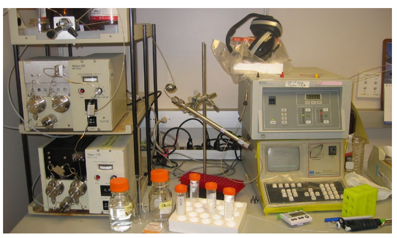
High-performance liquid chromatography was used to identify the molecular composition of cod liver oils.

The fermented product also had unexpectedly high amounts of collagen and its fermentation breakdown products, together with ammonia, indicating that the fermenting microbes were digesting collagen to create